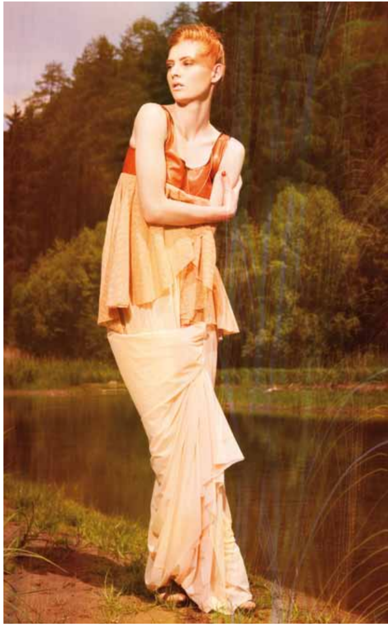
JEWELLERY MAIKE GERICKE / WWW.MAIKEGERICKE.DE